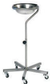
KRAFT 505 BOWL STAND SINGLE - S.S SIZE : H 840 mm X D 355 mm