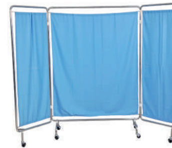
KRAFT 705 BED SIDE SCREEN S.S / M.S SIZE : H 1675mm X W 2440mm