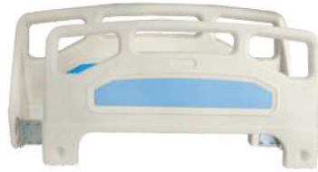
KRAFT 801 A ● ● ● P.P HEAD & LEG BOWS (DELUXE) approx wt: 4.950 kgs per set