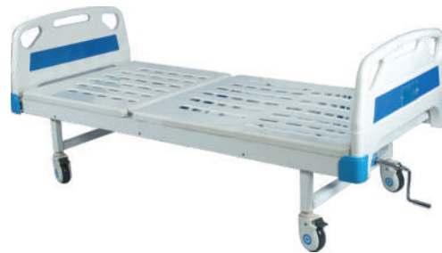
KRAFT 142 MANUAL SEMI FOWLER BACKREST BED 1 FUNCTION (DELUXE)