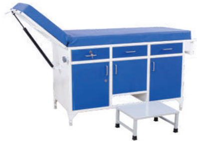
KRAFT 202 EXAMINATION COUCH WITH BACKREST SIZE : L 1830mm X W 575 mm X H 850mm