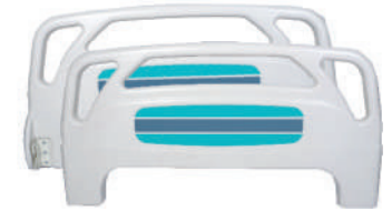
KRAFT 805 A ● ● ● ● ● ● P.P HEAD & LEG BOWS (EXCEL) (SET OF 2)