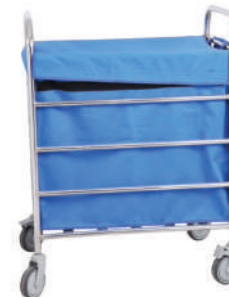
KRAFT 508 SOILED LINEN TROLLEY BIG - S.S SIZE : L 790mm W 560mm X H 1030mm