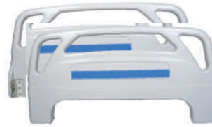
KRAFT 803 A ● ● ● ● P.P HEAD & LEG BOWS (DELUXE PLUS) (SET OF 2)