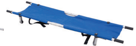
KRAFT 404 ALUMINIUM FOLDING STRETCHER