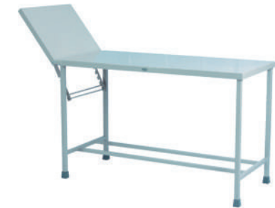
KRAFT 204 EXAMINATION TABLE S.S. SIZE : L 1830mm X W 537mm X H 810mm