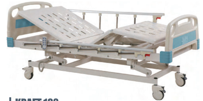
KRAFT 102 MOTORIZED ICU BED 5 FUNCTION (PREMIUM)