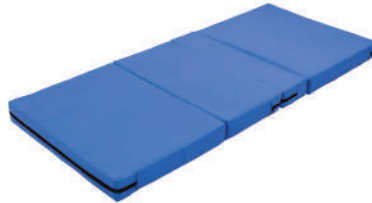
KRAFT 812 (3") / 812 A (4") MULTI FOLD FOAM MATTRESS