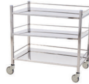
KRAFT 604 INSTRUMENT TROLLEY - S.S Available in various sizes