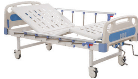
KRAFT 132 MANUAL FOWLER BED 2 FUNCTION (DELUXE)