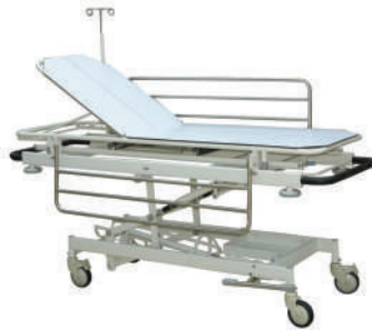
KRAFT 401 HYDRAULIC TRAUMA CARE RECOVERY TROLLEY