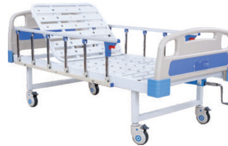
KRAFT 143 MANUAL SEMI FOWLER BACKREST BED 1 FUNCTION (ECONOMY)