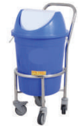
KRAFT 504 WASTE CARRYING TROLLEY S.S