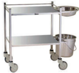
KRAFT 601 DRESSING TROLLEY Available in various sizes