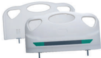
KRAFT 806 A ● ● ● ● ● ● P.P HEAD & LEG BOWS (EXCEL PLUS) (SET OF 2)