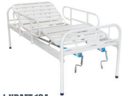
KRAFT 134 MANUAL FOWLER BED 2 FUNCTION (CLASSIC)