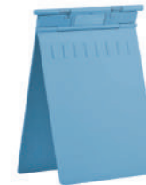
KRAFT 820 ABS CHART HOLDER