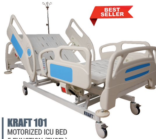
KRAFT 101 MOTORIZED ICU BED 5 FUNCTION (EXCEL)