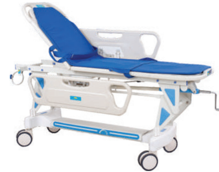
KRAFT 403 ABS PATIENT TRANSFER TROLLEY