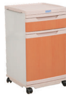
KRAFT 701 BED SIDE LOCKER ABS (DELUXE) SIZE : L 460mm X W 450mm X H 820mm