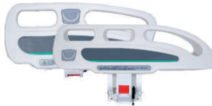
KRAFT 808 A ● ● ● ● ● ● TUCK AWAY P.P SIDE RAILS (SET OF 4)