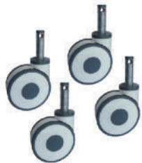
KRAFT 816 CENTRAL LOCKING CASTORS 125MM