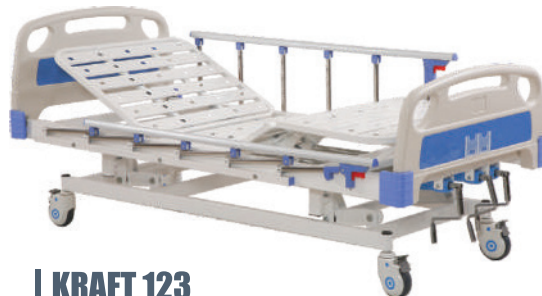
KRAFT 123 MANUAL ICU BED 3 FUNCTION (ECONOMY)