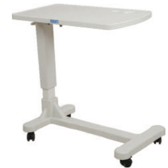
KRAFT 703 A ○ ● ADJUSTABLE BED SIDE TABLE GAS SPRING