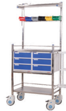
KRAFT 501 EMERGENCY CRASH CART - S.S