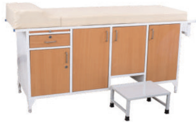
KRAFT 201 EXAMINATION COUCH SIZE : L 1830mm X W 575 mm X H 850mm