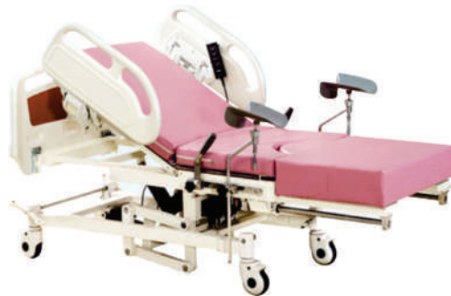
KRAFT 301 MOTORIZED OBSTETRIC LABOR & RECOVERY BED - 3 FUNCTION