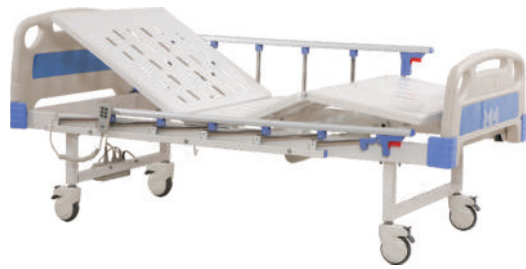
KRAFT 131 MOTORIZED FOWLER BED 2 FUNCTION (PREMIUM)