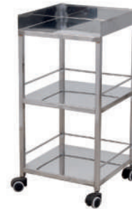
KRAFT 603 BED SIDE TROLLEY - S.S Available in various sizes