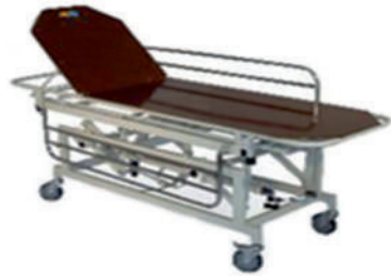
KRAFT 400 TRAUMA CARE RECOVERY TROLLEY By Screw Mecahnism