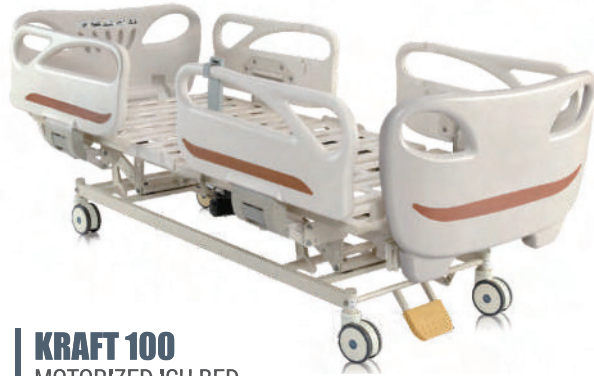
KRAFT 100 MOTORIZED ICU BED 5 FUNCTION (EXCEL PLUS)