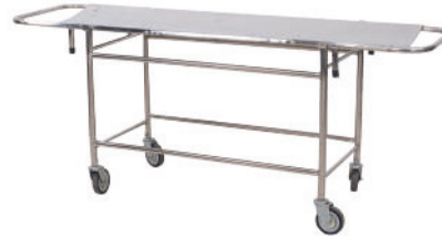
KRAFT 402 STRETCHER ON TROLLEY - SS SIZE : L 2030mm X W 610mm X H 870mm