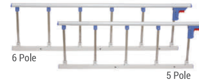
KRAFT 809 (6 Pole) / 809 A (5 Pole) STEEL COLLAPSIBLE SIDE RAILS (SET OF 2)