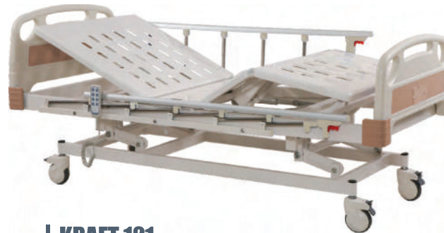
KRAFT 121 MOTORIZED ICU BED 3 FUNCTION (PREMIUM)