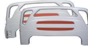
KRAFT 804 A ● ● ● ● ● P.P HEAD & LEG BOWS (PREMIUM) (SET OF 2)