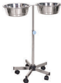
KRAFT 506 BOWL STAND DOUBLE - S.S SIZE : H 840 mm X D 355 mm