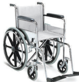
KRAFT 704 NON FOLDING WHEEL CHAIR S.S