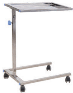
KRAFT 605 MAYO'S TROLLEY - S.S SIZE : L 560mm X W 445mm X H 810 to 1270mm