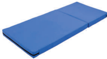
KRAFT 811 (3") / 811 A (4") SINGLE FOLD FOAM MATTRESS