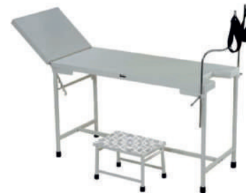
KRAFT 303 SIMPLE GYNAEC DELIVERY TABLE S.S./M.S. SIZE : L 1830mm X W 760mm X H 760mm