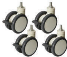
KRAFT 817 TWIN CASTORS 125MM