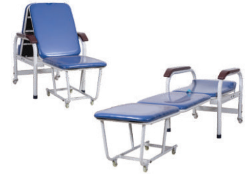
KRAFT 154 ATTENDANT BED CUM CHAIR