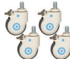
KRAFT 819 ECONOMY CASTORS 125MM