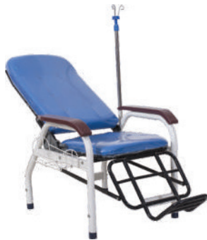
KRAFT 205 BLOOD DONATION COUCH