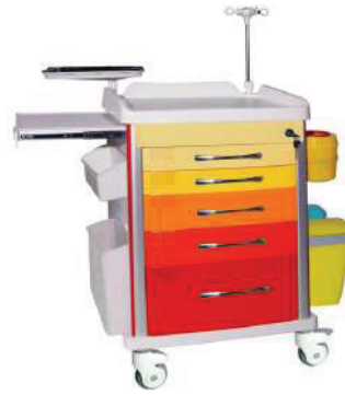
KRAFT 500 C ABS EMERGENCY TROLLEY ( DELUXE)