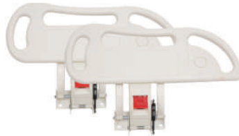
KRAFT 807 ○ ● ● ● ● ● TUCK AWAY P.P SIDE RAILS (SET OF 4)