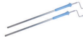
KRAFT 814 BED CRANK - 48"