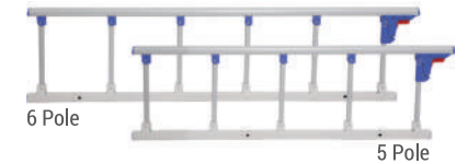
KRAFT 810 (6 Pole) / 810 A (5 Pole) ALUMINIUM COLLAPSIBLE SIDE RAILS (SET OF 2)