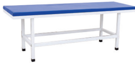
KRAFT 152 ATTENDANT BED SIZE : L 1830mm X W 610mm X H 380mm