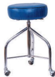
KRAFT 507 REVOLVING STOOL - S.S SIZE : W 290mm X H 425mm to 675mm