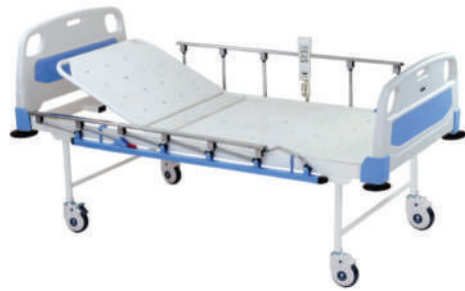
KRAFT 141 MOTORIZED SEMI FOWLER BACKREST BED 1 FUNCTION (PREMIUM)