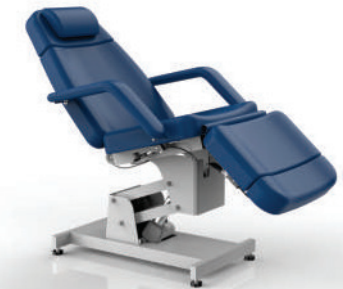
KRAFT 304 SEMI MOTORIZED DIALYSIS CHAIR SIZE : L 1850 mm X W 790 mm X H 640-860 mm