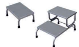
KRAFT 510 / 511 SINGLE STEP STOOL - S.S / M.S SIZE : L 450mm X B 225mm X H 225mm DOUBLE STEP STOOL - S.S / M.S SIZE : L 450mm X B 400mm X H 400mm