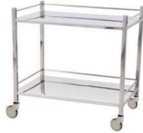
KRAFT 602 INSTRUMENT TROLLEY - S.S Available in various sizes