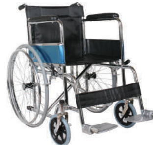
KRAFT 704 A FOLDING WHEEL CHAIR