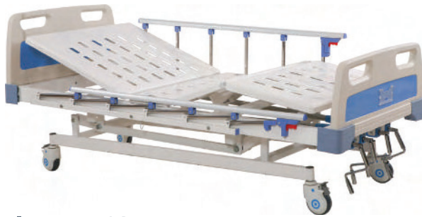
KRAFT 103 MANUAL ICU BED 5 FUNCTION (DELUXE)