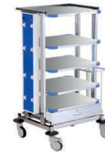
KRAFT 503 MONITOR TROLLEY M.S