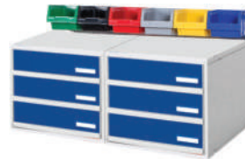
KRAFT 813 CRASH CART ACCESSORIES 2 CABINET & 6 UTILITY BINS