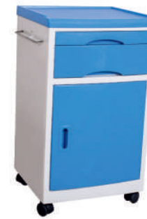
KRAFT 702 BED SIDE LOCKER ABS SIZE : L 445mm X W 415mm X H 770mm