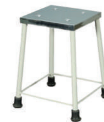
KRAFT 509 BED SIDE STOOL WITH S.S TOP SIZE : L 405mm X W 405 mm X H 455mm