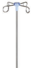
KRAFT 822 I.V ATTACHMENT FOR BED