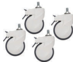
KRAFT 818 HEAVY CASTORS 125MM