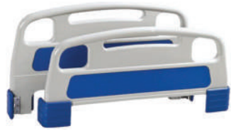
KRAFT 801 ● ● P.P HEAD & LEG BOWS (ECONOMY) approx wt: 4.500 kgs per set