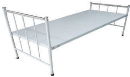
KRAFT 151 PLAIN BED CLASSIC SIZE : L 1900mm X W 900 mm X H 560mm