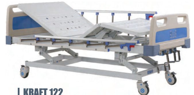
KRAFT 122 MANUAL ICU BED 3 FUNCTION (DELUXE)