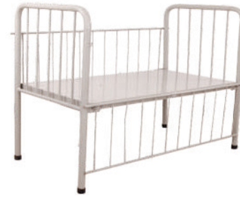
KRAFT 153 PEDIATRIC BED CLASSIC SIZE : L 1370mm X W 625mm X H 560mm