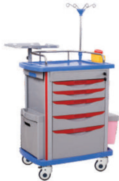
KRAFT 500 A ABS EMERGENCY TROLLEY