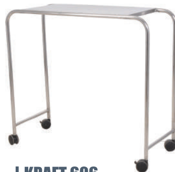
KRAFT 606 OVER BED TABLE - S.S SIZE : L 1115mm X W 445mm X H 965mm