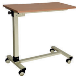
KRAFT 703 B ADJUSTABLE BED SIDE TABLE WITH KNOB