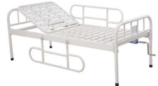
KRAFT 144 MANUAL SEMI FOWLER BACKREST BED 1 FUNCTION (CLASSIC)