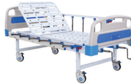
KRAFT 133 MANUAL FOWLER BED 2 FUNCTION (ECONOMY)