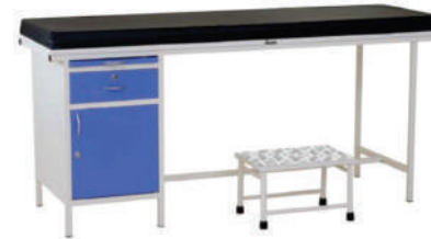
KRAFT 203 SIMPLE EXAMINATION COUCH SIZE : L 1830mm X W 575mm X H 850mm