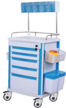
KRAFT 500 B ABS ANESTHESIA TROLLEY